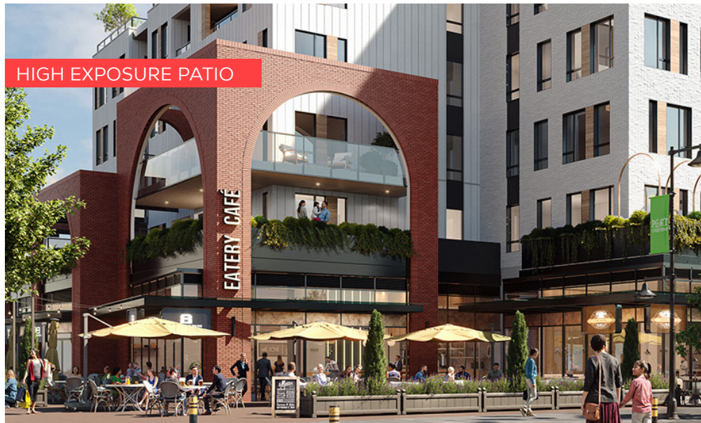
HIGH EXPOSURE PATIO