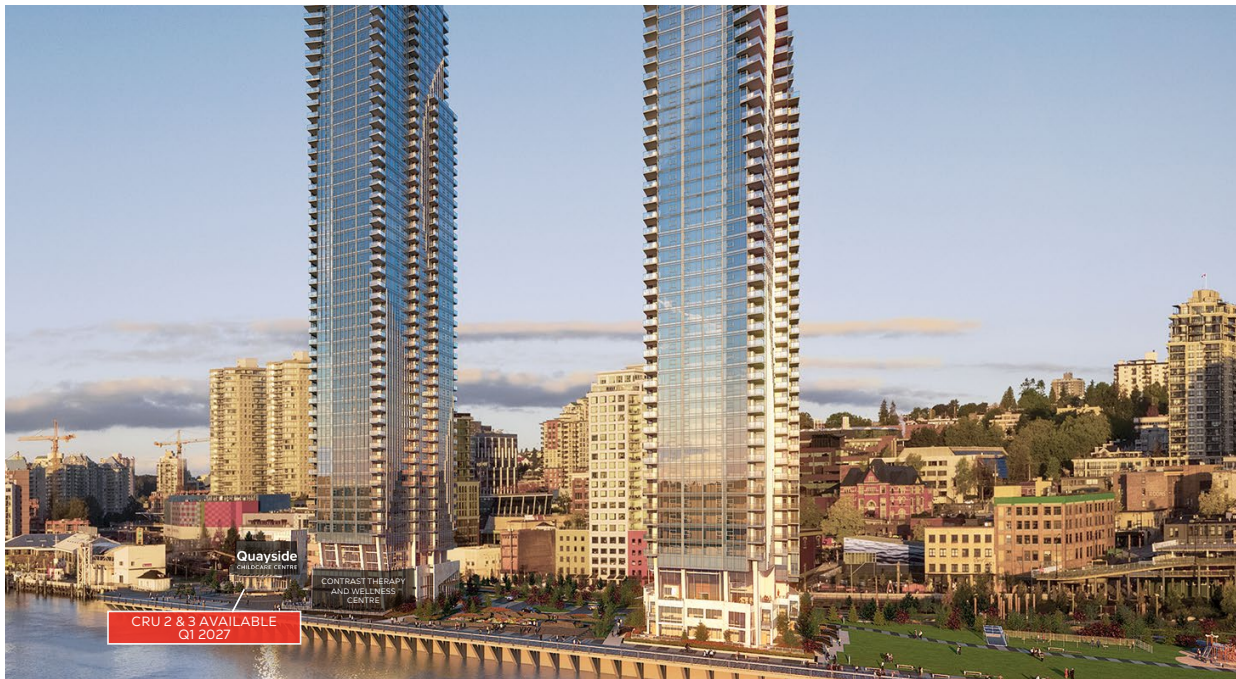
CRU 2 & 3 AVAILABLE Q1 2027