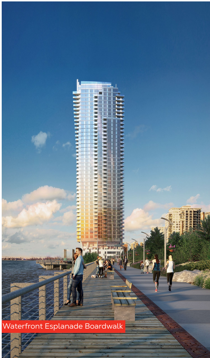
Waterfront Esplanade Boardwalk