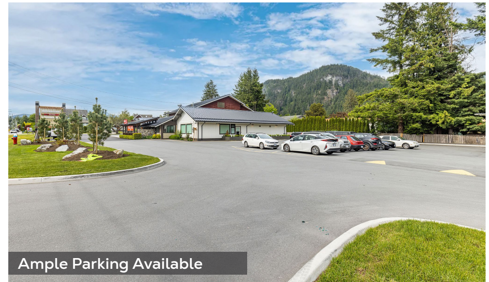
Ample Parking Available