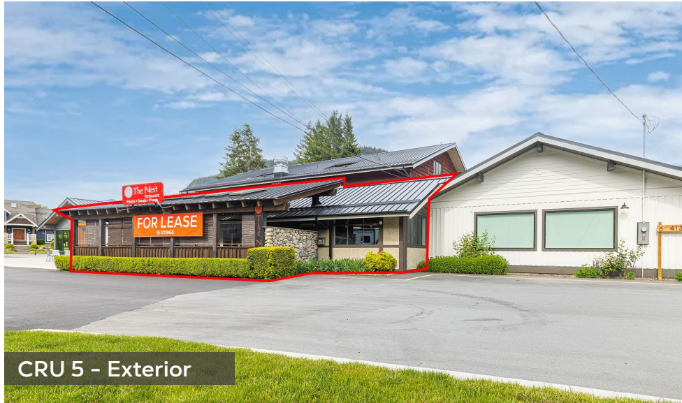
CRU 5 - Exterior