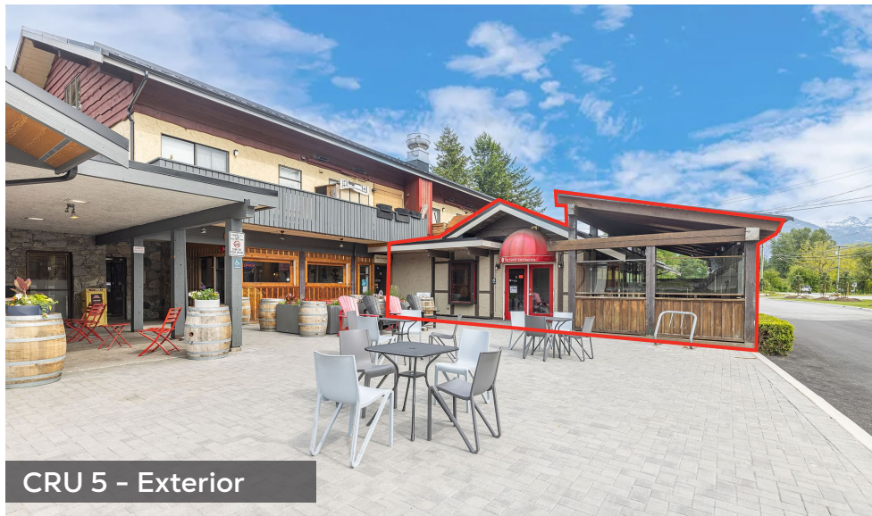
CRU 5 - Exterior