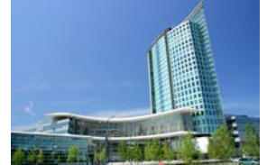
Central City Centre Surrey, BC