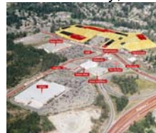
Millstream Village Victoria, BC