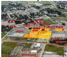
Pine Centre Strathmore, AB