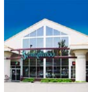
Semiahmoo Centre South Surrey, BC