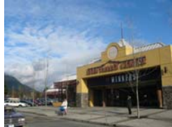
Lynn Valley Centre North Vancouver, BC