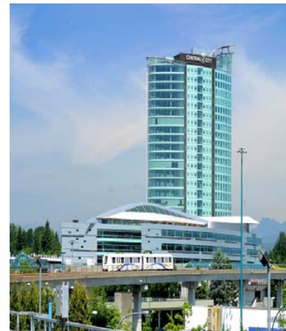
"Central City is located in one of Canada's fastest growing cities, Surrey BC"

The Sitings team is working in conjunction with Bentall Property Management and the executives at Central City to target a grand re-opening for Fall 2008.