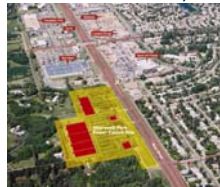
Sherwood Park Sherwood Park, AB