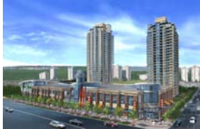
North Road Centre Burnaby, BC