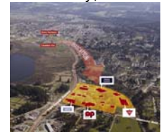
Norcross Shopping Centre Duncan, BC