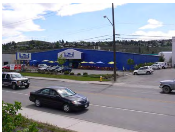
"This site is an excellent opportunity for furniture retailers"