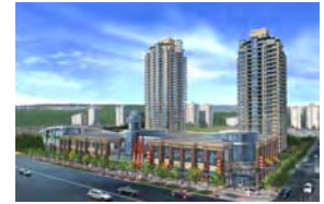
North Road Centre Burnaby, BC