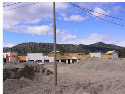
"The Summit Shopping Centre will be available fall 2006"