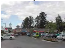
View Royal Victoria, BC