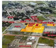
Pine Centre Strathmore, AB