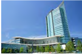
Central City Centre Surrey, BC