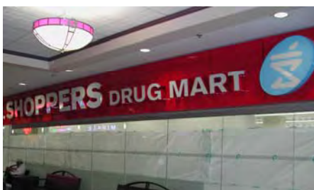
"A newly expanded Shoppers Drug Mart opening this summer"