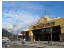
Lynn Valley Centre North Vancouver, BC