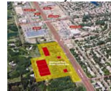
Sherwood Park Sherwood Park, AB