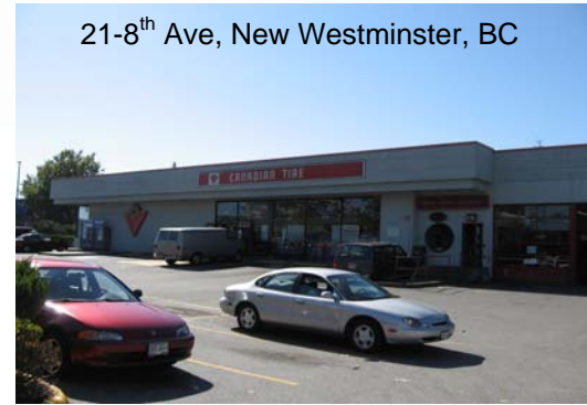
21-8 th Ave, New Westminster, BC