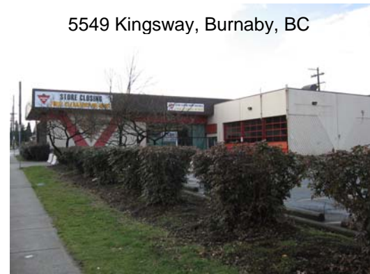
5549 Kingsway, Burnaby, BC