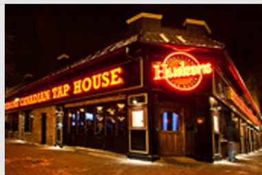
Whyte Ave, Edmonton